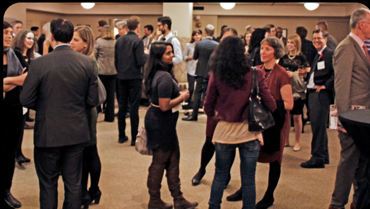
OLIP Fall Reception, 2016

All partners are invited to exclusive OLIP events which are attended by Party leaders, MPPs across all parties, alumni, and other long standing partners of the programme - making them excellent networking opportunities.