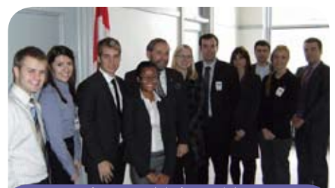
Thomas Mulcair MP