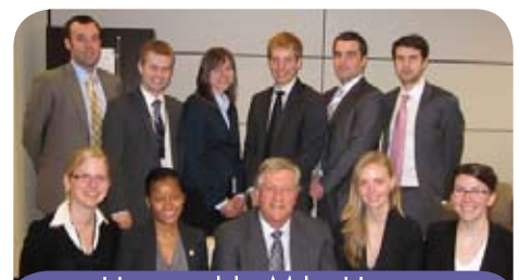
Honourable Mike Harris Former Premier of Ontario