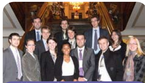
Meeting the Quebec Interns