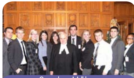
Speaker Milliken House of Commons