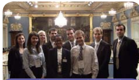
Tour of the National Assembly