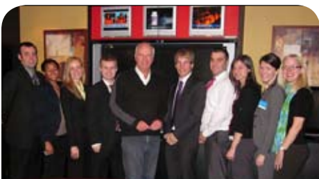
Peter Mansbridge CBC's The National