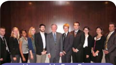
Honourable Ernie Eves Former Premier of Ontario