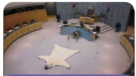
Legislative Assembly Chamber