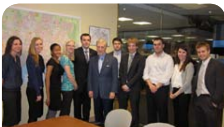
Lloyd Robertson CTV Evening News