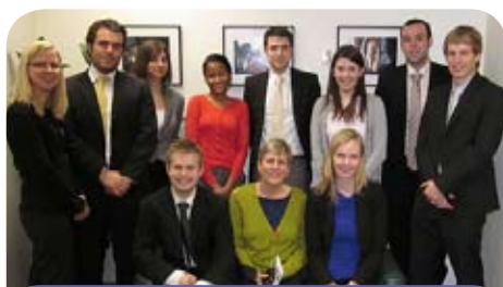
Ms. Sparling, Deputy Minister, Intergovernmental and Aboriginal Affairs