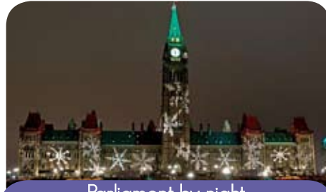
Parliament by night

Overall, our visit to Ottawa was a resounding success! By the end of the trip we all felt more than ready to bring our newly minted federal perspective back with us to our placements at Queen's Park. After a good night's sleep that is!