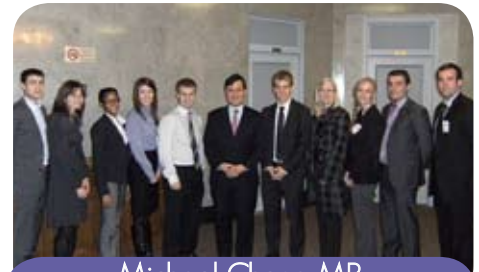
Michael Chong MP