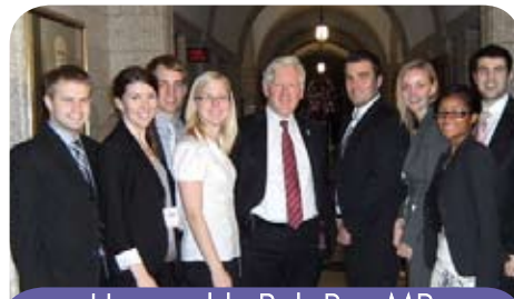
Honourable Bob Rae MP Former Premier of Ontario