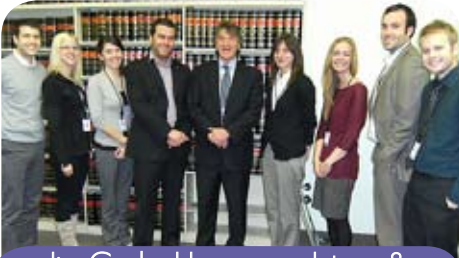
Jim Coyle, Honourary Intern & Toronto Star Columnist