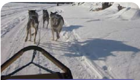
Interns Dog Sledding