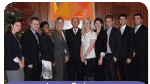
Justice Rothstein and Parliamentary Interns