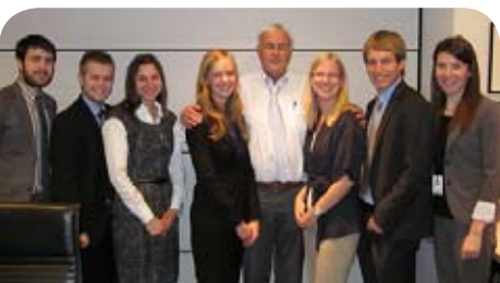
Honourable David Peterson Former Premier of Ontario