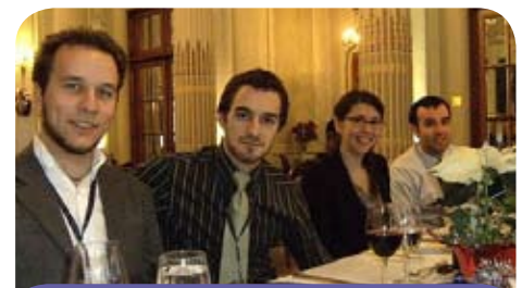
Dinner with the Quebec Interns