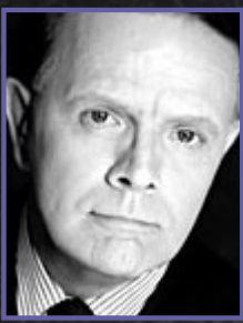
QPI PAGE 6